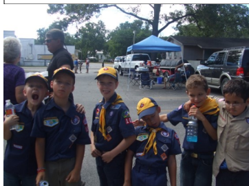
Fun at Pack 102 BBQ Fundraiser

Welcome to our Pack! Cub Scouts is a fun activity program that also teaches important values along the way. At Pack 102, we do cool stuff every Tuesday at 6 p.m. We are glad you are here! Bring a friend and get a treat! If that friend joins our pack, you will get a very special Recruiter patch to wear on your uniform!