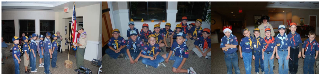
Pack 102 scouts have been very honored to work with Morningside Ministries this fall, first by providing a special flag ceremony for the veterans on Veterans Day (left and middle) and then caroling in December for all the residents (right).