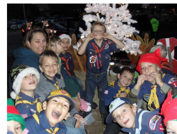
Pack 102 scouts were all about 'The Grinch That Stole Christmas' theme at the 2010 Boerne